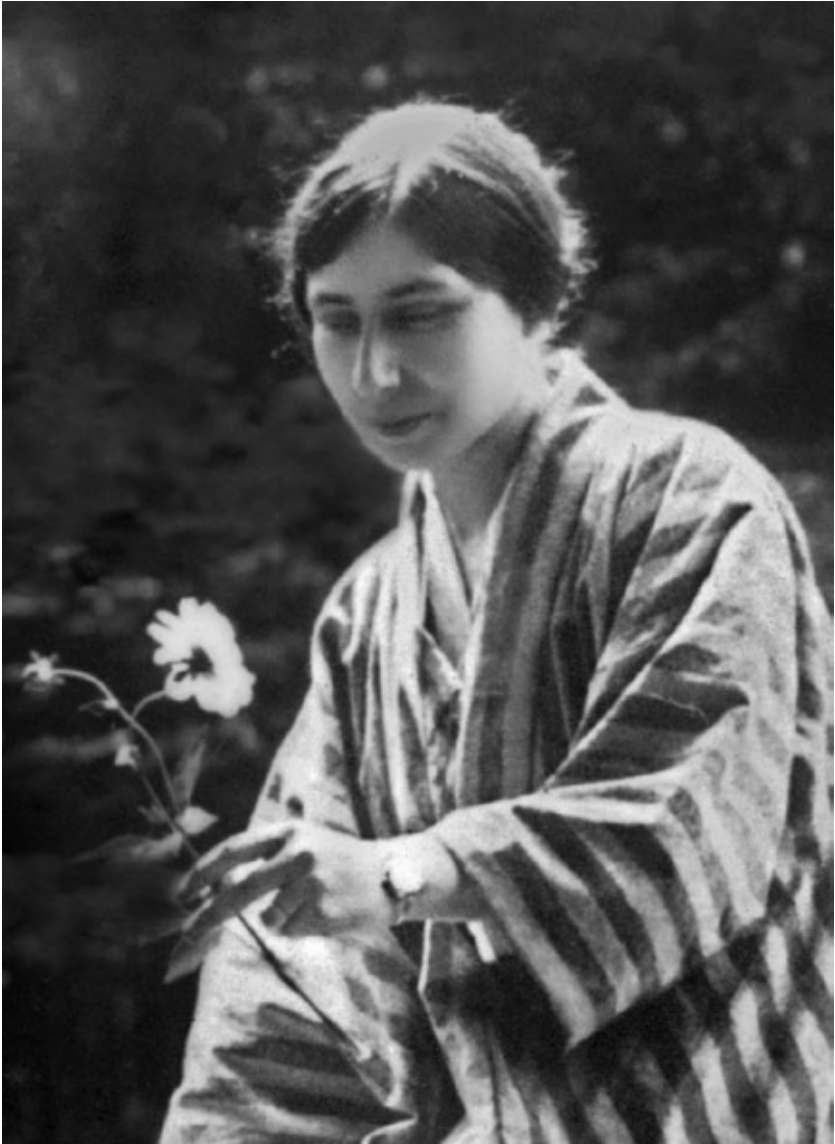
The Mother in Tokyo, 1916